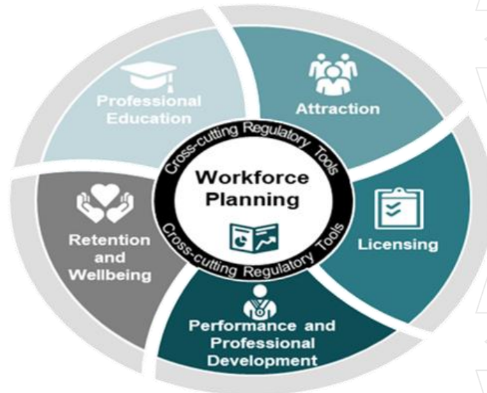
Figure 1. Healthcare Workforce Governance Framework